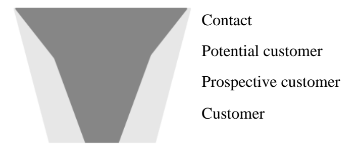
Figure 2: Typical and ideal (desired) sales funnel and the phases(D'Haen & Van den Poel, 2013).

The form of the sales funnel varies from company to company. In Figure 2 we present a classical form of the sales funnel (colored dark) and the ideal or desired form of the sales funnel (colored light). D'Haen & Van den Poel (2013) describe following phases through which customers go throughout the buying process: a contact, a potential customer, a prospective customer and finally an actual customer. This definition of stages of the sales funnel is also used in the studied company.