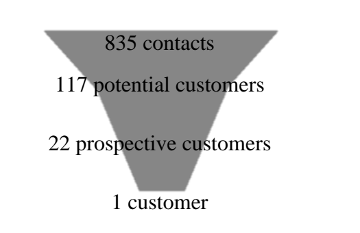
Figure 5: The company's sales funnel in the period three years after the implementation of supporting IS

From the structure of the sale funnel in this period shown in Figure 5 we can see that in order to obtain 1 new customer the company needed only 6% as many contacts, 17% as many potential customers, and 29% as many prospective customers compared to the period right after the implementation of the IS to support the SFM process.